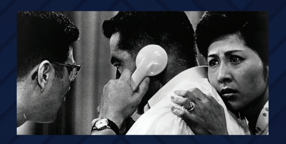
NOVEMBER 26, 29